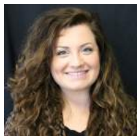
2020 Committee Chair

Upon confirmation of your mentorship pair, you will also be matched with an Ambassador. This person will provide guidance and support throughout the program and will be available to answer any questions that you have. We want to ensure you have a rewarding and meaningful experience and therefore encourage you to connect with your Ambassador as needed.