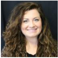
2020 Committee Chair

Upon confirmation of your mentorship pair, you will also be matched with an Ambassador. This person will provide guidance and support throughout the program and will be available to answer any questions that you have. We want to ensure you have a rewarding and meaningful experience and therefore encourage you to connect with your Ambassador as needed.