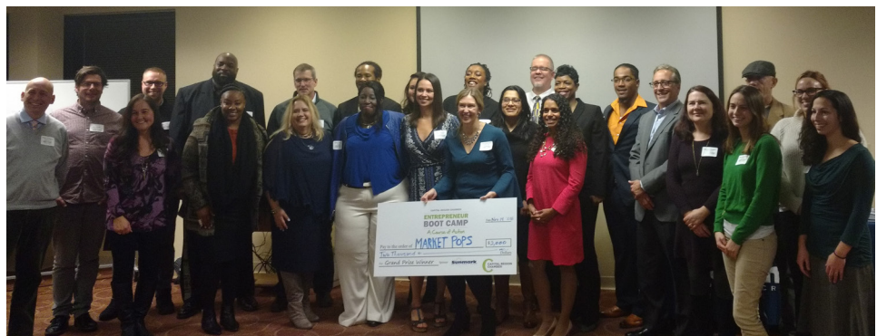
Fall 2018 Entrepreneur Boot Camp class