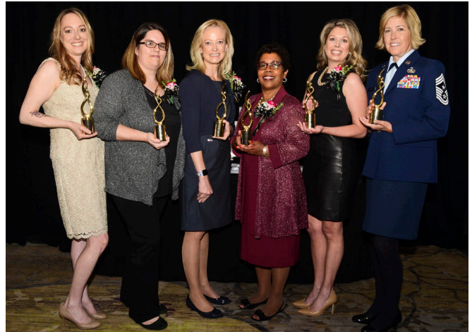
Women of Excellence Awards