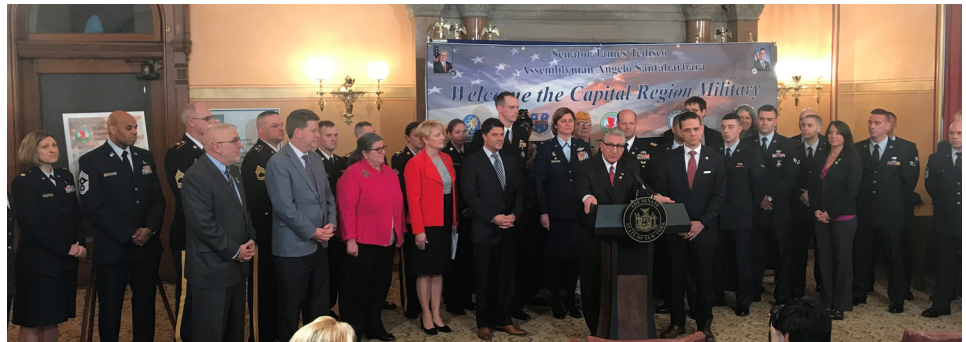
Military Day at the Capitol